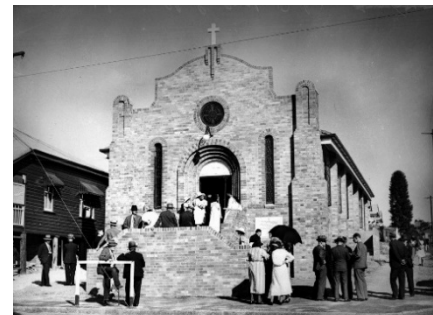
St Clement's Catholic Church, c.1937

Enquiries phone: ALHS Qld Hon. Secretary, 0400 571 387